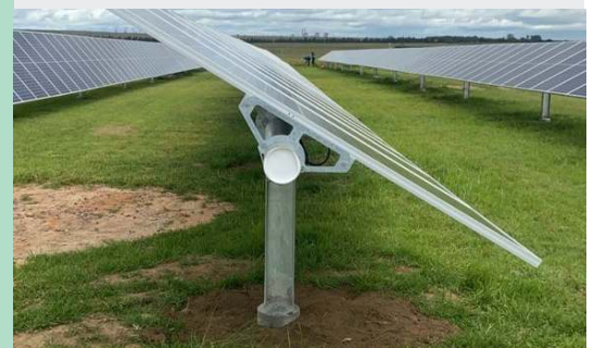
↑ Single axis trackers

To meet the visibility requirement, two television screens were installed (by client) in the shop with a live feed provided from NSE's monitoring platform. In this way, customers have a live view of the system's output data.