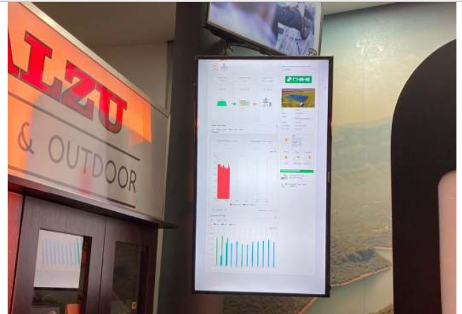
↑ Screens in shop to show solar plant production

This solar system is also grid-tied, meaning that it is connected to the national electricity grid.